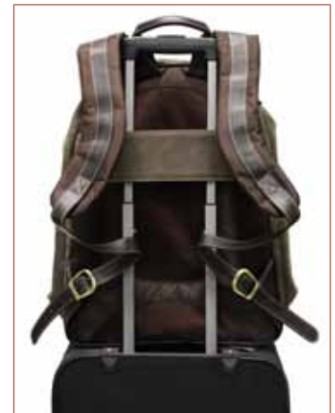
The back panel has a webbing strap to fit securely over a luggage handle

(1P3R) 15 16-60 61-180 181-360 Deboss 202.00 162.15 156.23 149.67